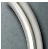
Satin Stainless Steel (US32D)