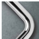
Bright Polished Stainless Steel (US32)