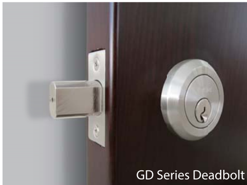
GD Series Deadbolt