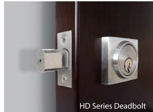
HD Series Deadbolt